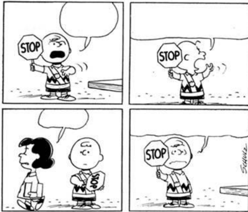
(Figura 2. Recuperado de: https://sites.google.com/a/springfield.k12.or.us/asms-7th-grade-language-arts-and-social-studies-wiki/language-arts/2nd-quarter , ASMS 7th Grade Language Arts and Social Studies. 2016)